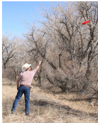
Lofting the Bagit!

Now bring your dog around from downwind so he can pick up the scent (the Bagit! is orange so you can spot it, but dogs can't see this bright color, so they have to scent it with their noses). Once point is established, just open up the Bagit! by stepping on one tab, and pulling on the other. Now you can either nudge the bird out with your foot, or simply step back and wait. Your dog will have to wait with you—a good test of his staunchness.